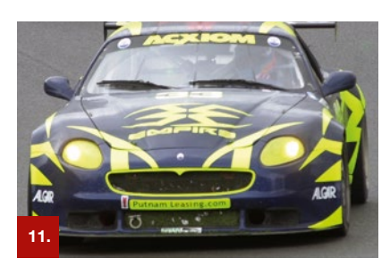
Example 11 ORACAL® 7510