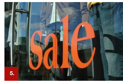
Example 5 ORACAL® 641