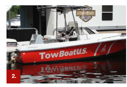
Example 2 ORACAL® 751C