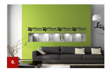
Example 6 ORACAL® 638