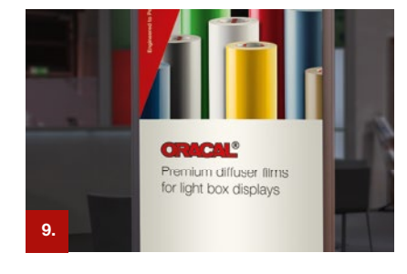
Example 9 ORACAL® 8830