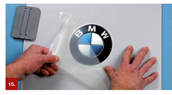
Example 15 ORATAPE® MT95

Reliable application tapes are required when computer-cut films are to be professionally and quickly applied. ORAFOL has developed application materials for a great variety of demands and uses.