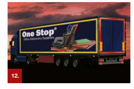
Example 12 ORACAL® 5600E