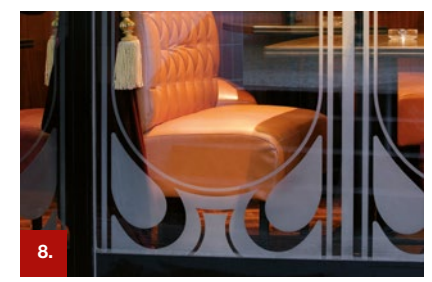
Example 8 ORACAL® 8810