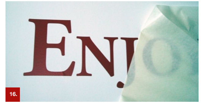
Example 16 ORATAPE® LT52