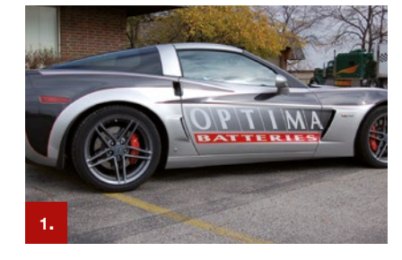
Example 1 ORACAL® 951

Designed for short and medium-term applications, this CAD/CAM vinyl can be used both indoors and outdoors. Its versatility and a range of 59 vivid colours with glossy finish and 56 colours in a matt finish makes it a perfect match for a wide range of decorative works. It displays an excellent degree of opaqueness and comes with a permanent solvent polyacrylate adhesive to allow for an outdoor durability of up to 5 years.